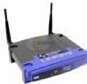
A wireless router.

So what is needed to make your laptop wireless and what exactly does that mean? What I am talking about is setting up a network between two computers so that you can share your internet connection wirelessly.